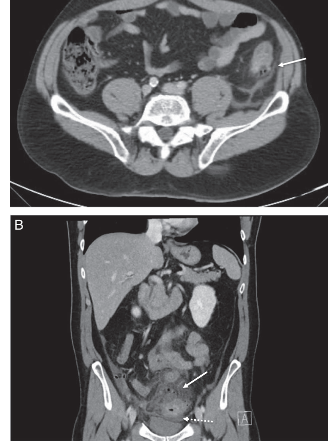
Figure 2. Computed tomography scan at index admission. (a) Patient presenting with only pericolic free gas (arrow). (b) Patient presenting with pericolic free gas (arrow) and pericolic fluid (dotted arrow).

Treatment failure has been defined as readmission, rescue operative strategy, and/or any interventional procedure performed (including percutaneous drainage).